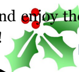
Photo Gallery ANYTHING GOES

~All are welcome to join the carolers or to just come and enjoy the celebration as we kick off the holiday season in Saginaw!